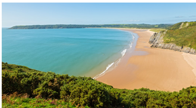
Oxwich Bay, Wales

These will take place in the coffee lounge, except for the 22nd which will be in the large hall and will be followed by a 'Crafty' session, which you can join in with if you like or just sit and have another cuppa and chat. We will be serving ploughman's lunches, and there will be a selection of cheeses and meats. Everyone is welcome to come and share in this time of fellowship.