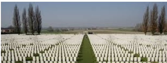
Tyne Cot Cemetery